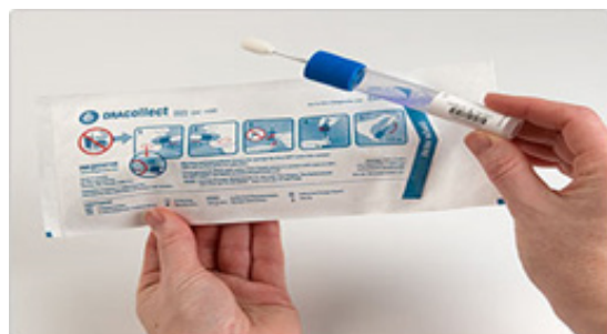
Figure 1. ORAcollect (OC-100) Collection Kit for human oral samples.

With advances in genomics research and clinical diagnostics, there is a need for rapid, high throughput and cost-effective technologies for purifying high quality DNA from cheek samples. DNA Genotek's ORAcollect (Figure 1) offers a painless, non-invasive method for collection of oral cavity DNA samples. DNA from these samples has been extracted using Omega Bio-tek's Mag-BIND® Blood & Tissue DNA HDQ 96 Kit (M6399). Here, we demonstrate a streamlined workflow for processing up to 96 ORAcollect oral samples in a single run on 2 open-ended automation platforms, Hamilton Microlab® STAR™ and Qiagen BioSprint® 96.